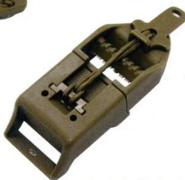
SIZE ACETAL 1" 10159

Tensionlock with quick assembly to be used on backpack shoulder straps.