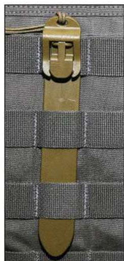
6" cord 10298 w/o cord 10191